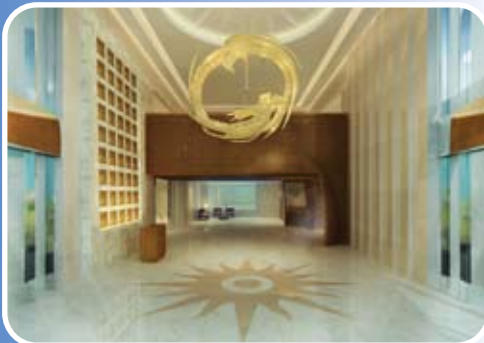
Lobby and reception area