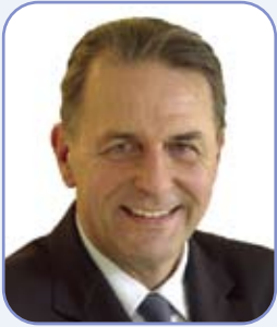
Dr. Jacques Rogge President International Olympic Committee

Welcome to Sporting Asia, the new publication of the Olympic Council of Asia (OCA).