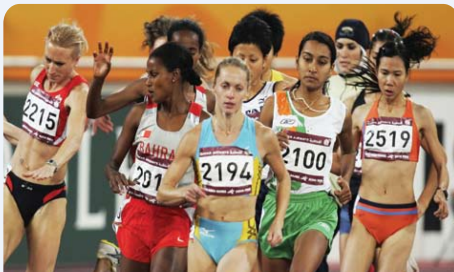
Women in sports will be a Congress talking point

"The objectives are to increase the awareness of sports science among Asian National Olympic Committees (NOCs); to exchange experiences in all sports fields with all sports partners, such as the IOC, NOCs, Asian Federations, International Federations, media, universities, sports acad-