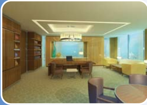
The Director General's Office