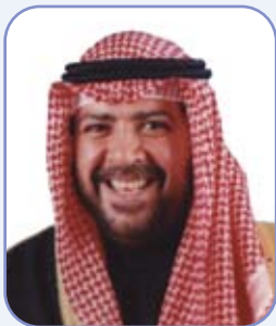
Sheikh Ahmad Al-Fahad Al-Sabah President Olympic Council of Asia

As President of the Olympic Council of Asia, it is my great pleasure to welcome you all to Kuwait at the start of a busy and exciting year for Asian sport. First of all we will celebrate the official opening of the OCA's magnificent new headquarters on March 11.