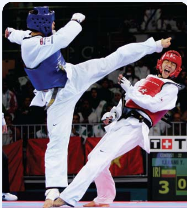
Taekwondo will be a highlight of the first Asian Martial Arts Games in Thailand

"No Olympic sports are included in the Asian Indoor Games, so it is an opportunity for the Asian youth and athletes in these sports to compete in a multi-sports event like athletes in other Games. It is also an opportunity to develop sports that are specific to the Asian continent."