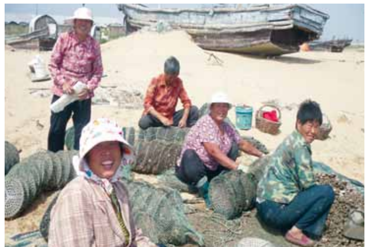
The fishing net, as opposed to the Internet, is still the most important part of daily life for these local women of the sea.