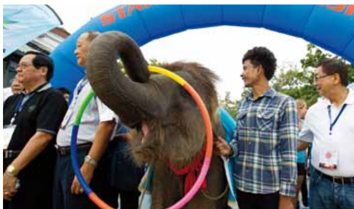
A baby elephant joins in the fun at Phuket

Fifty VIP guests from the OS/OCA Regional Forum joined in the 1.8km fun run together with more than 600 students from local schools.