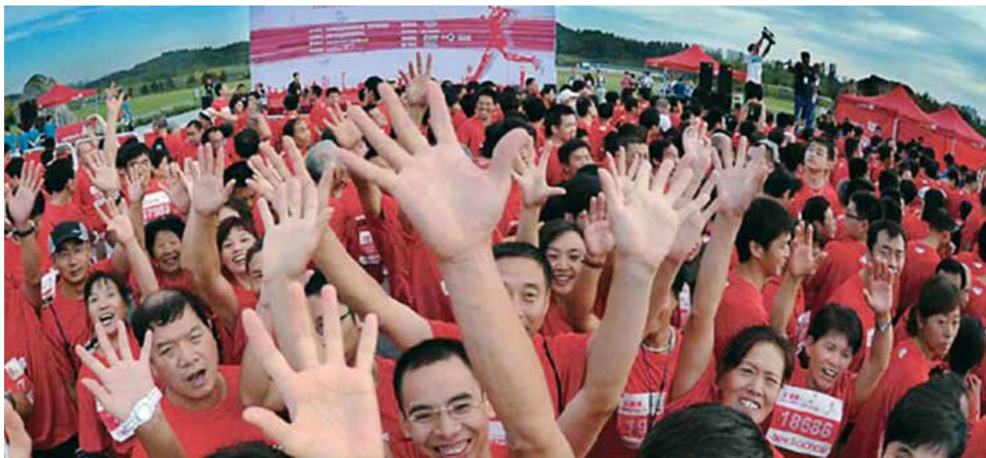
Enjoying Sport For All