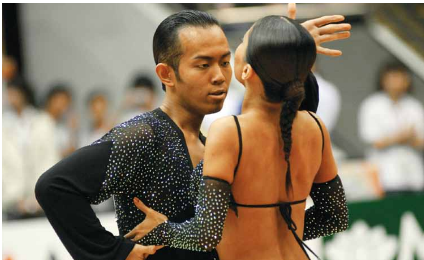
Dance sport will offer 10 gold medals at Incheon 2013

Main Media Centre: Songdo Convensia, MMC for Asian Games 2014