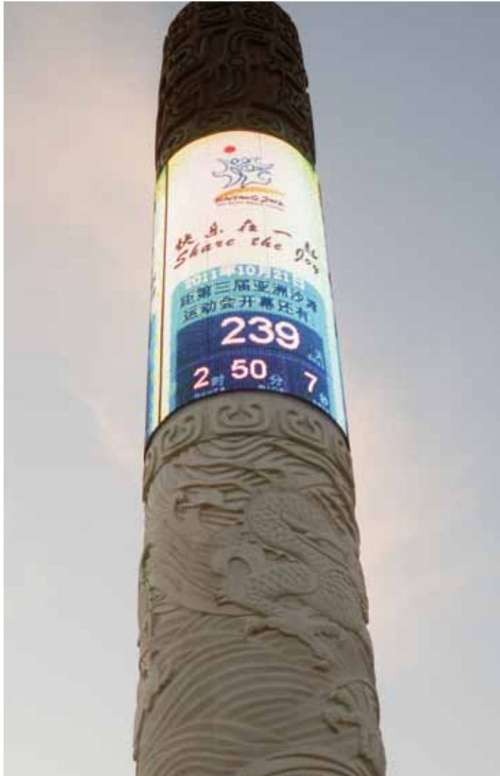
One of the countdown clocks in Haiyang, as dusk approaches