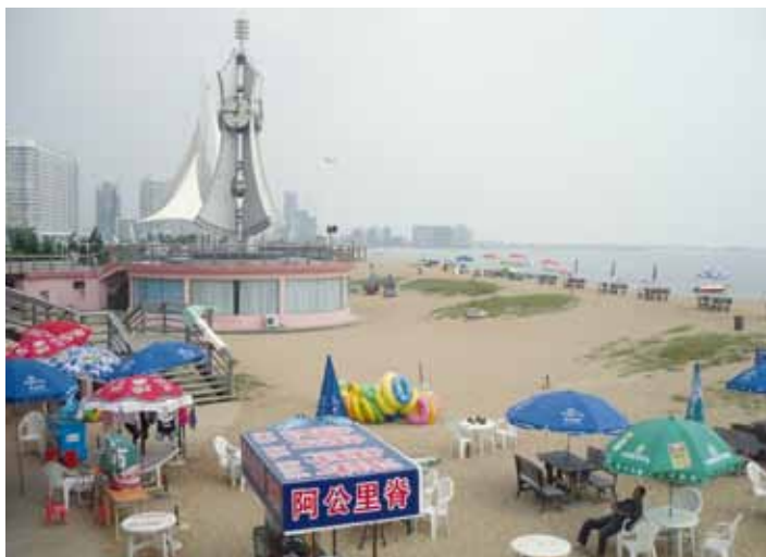
A typical seaside snapshot