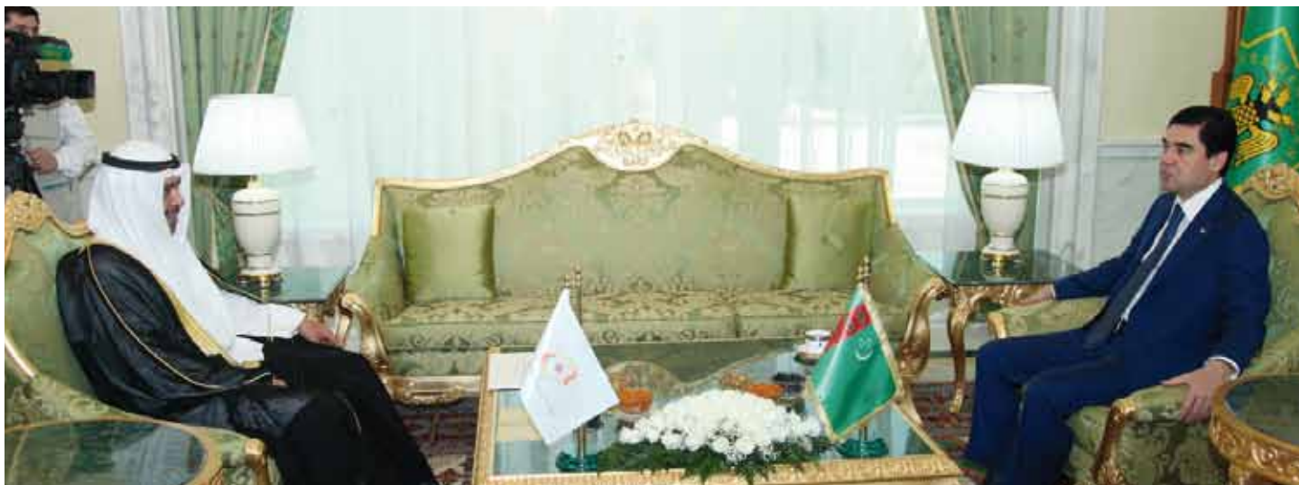
The OCA President is received by the President of Turkmenistan, Gurbanguly Berdimuhamedov, on Monday, October 17.