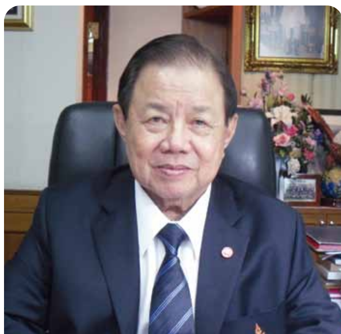
General Yuthasak Sasiprapha, President, NOC Thailand; Hon. Life President, SEA Games Federation.

Under the royal patronage of the King, the National Olympic Committee of Thailand has proved to be a loyal and trusted friend and servant of the Olympic Council of Asia.