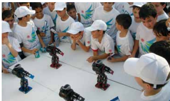
The dancing robots are the centre of attention in Dubai