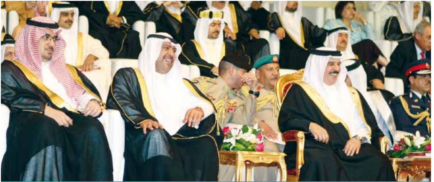
A royal occasion at Bahrain 11