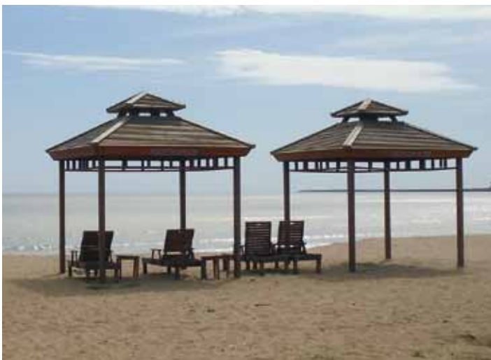
A relaxing location on the Haiyang sea front