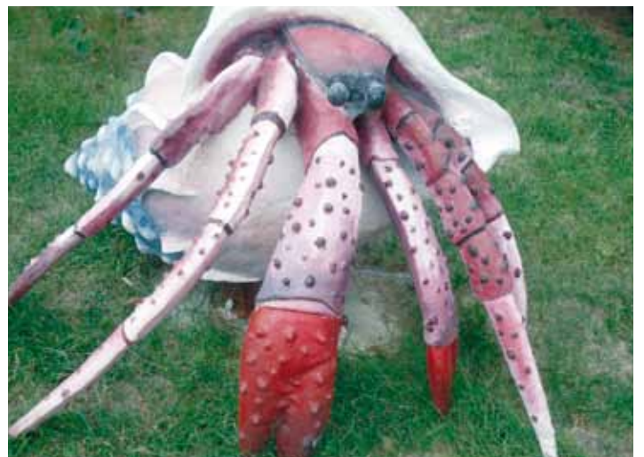
The seafood comes in big portions in Haiyang