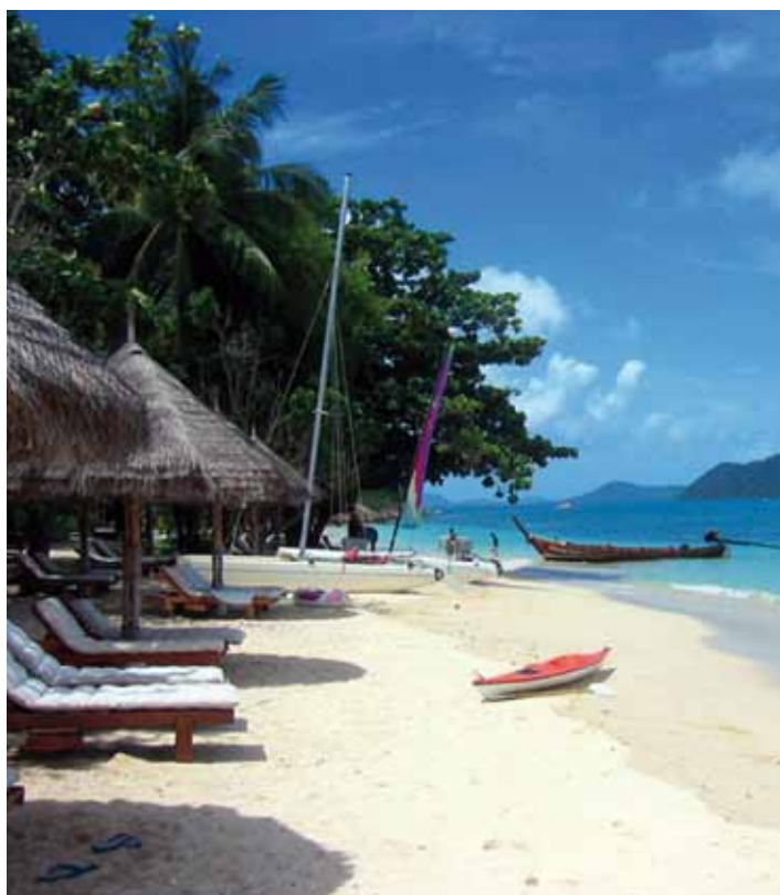
Beautiful Phuket will host the 2014 Asian Beach Games