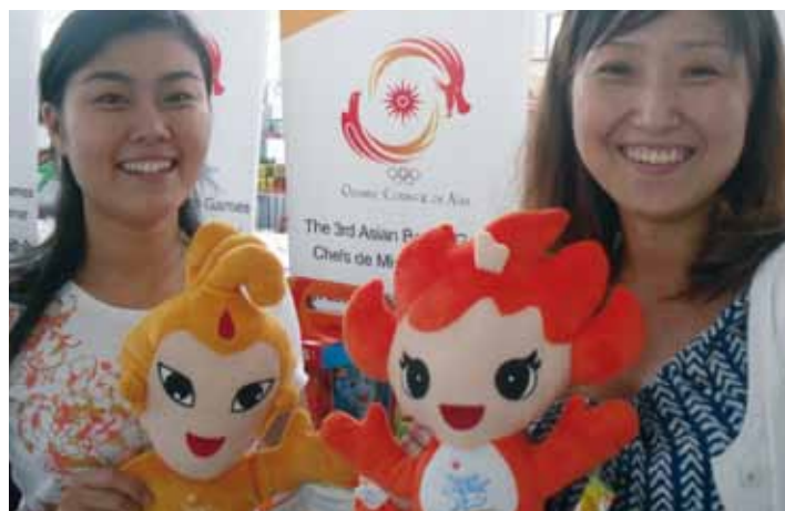
HABGOC staff with souvenir mascots

Previous test events had been held in powered paragliding, roller skating, beach football and sport climbing.