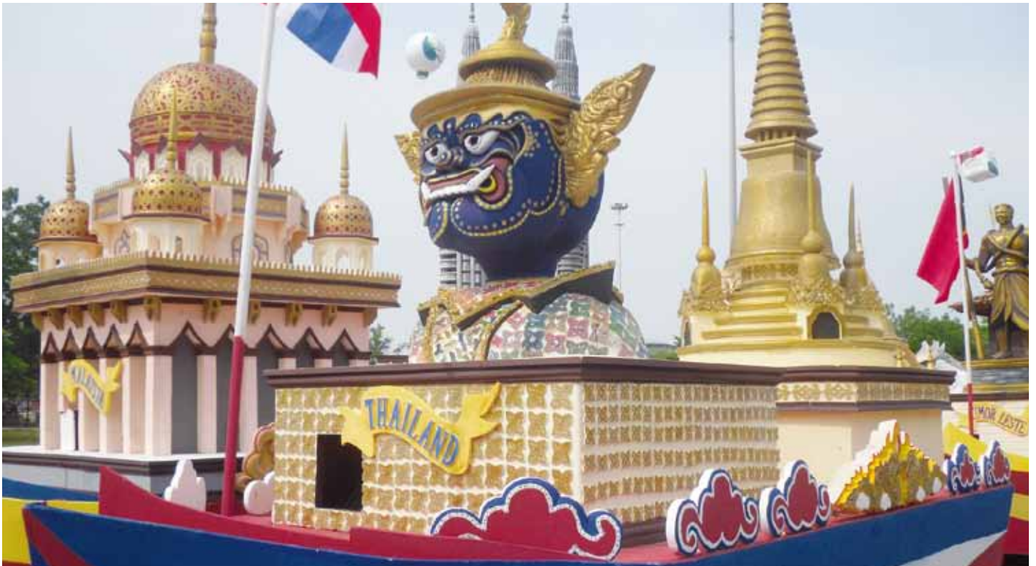
Typically Thailand - always a popular team in multi-sports events.