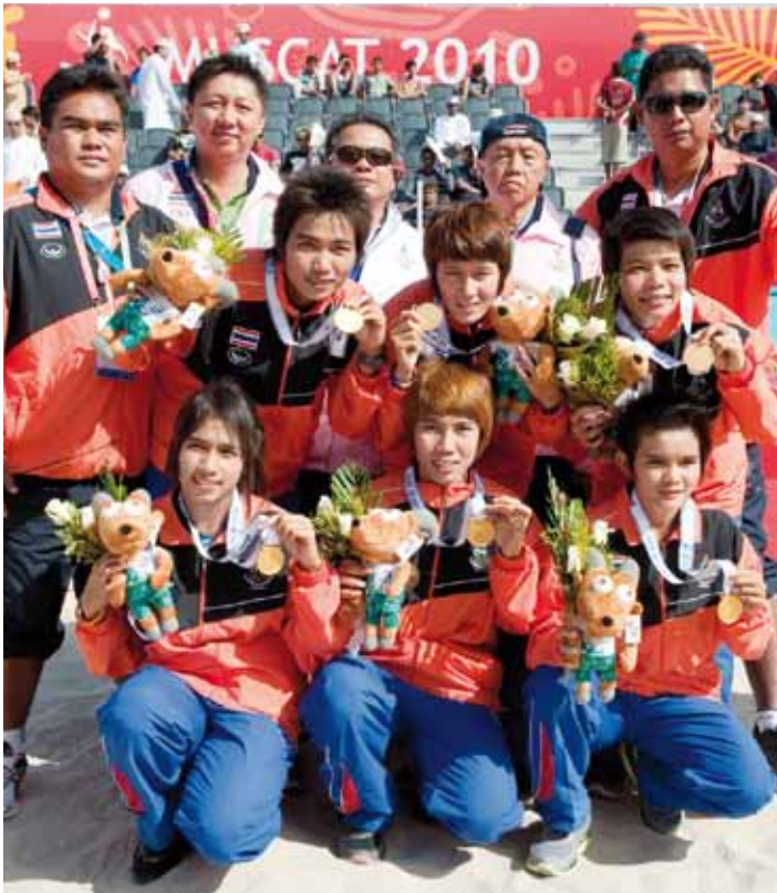
Thai athletes celebrate more gold