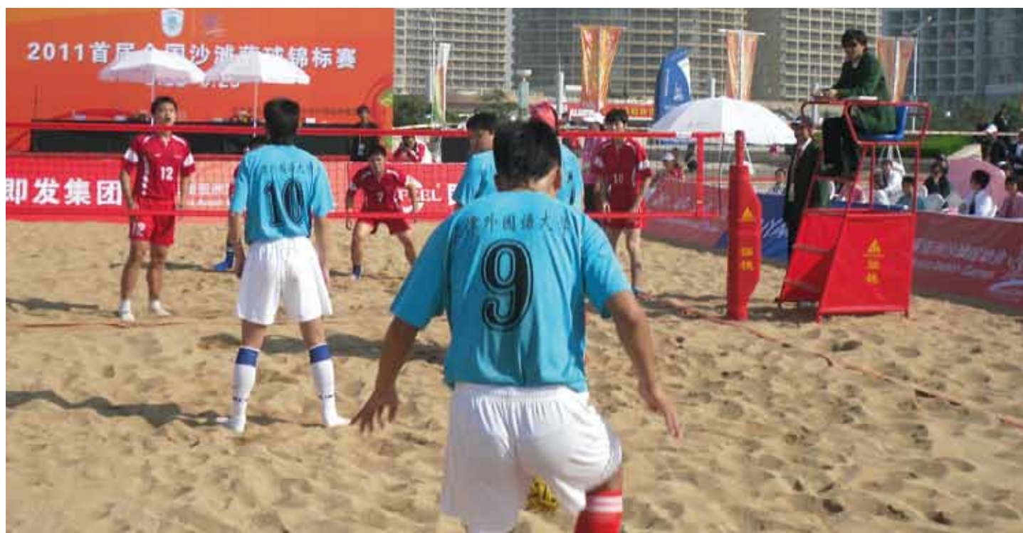
Sepaktakraw on Haiyang sea front