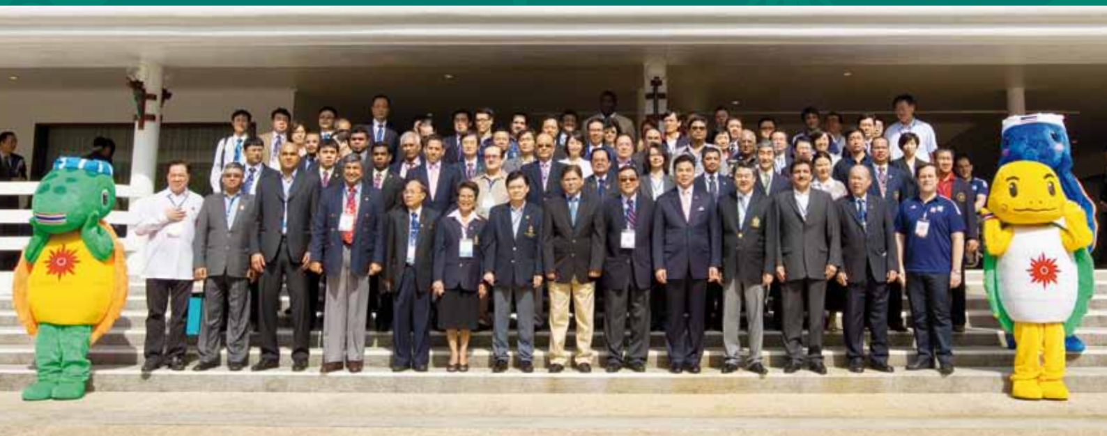
Phuket participants have a souvenir photo