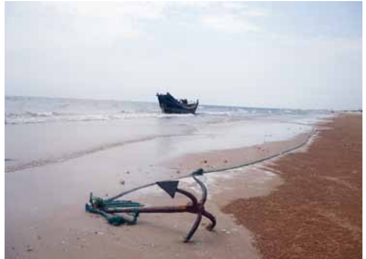
A tranquil scene on the shore of the Yellow Sea