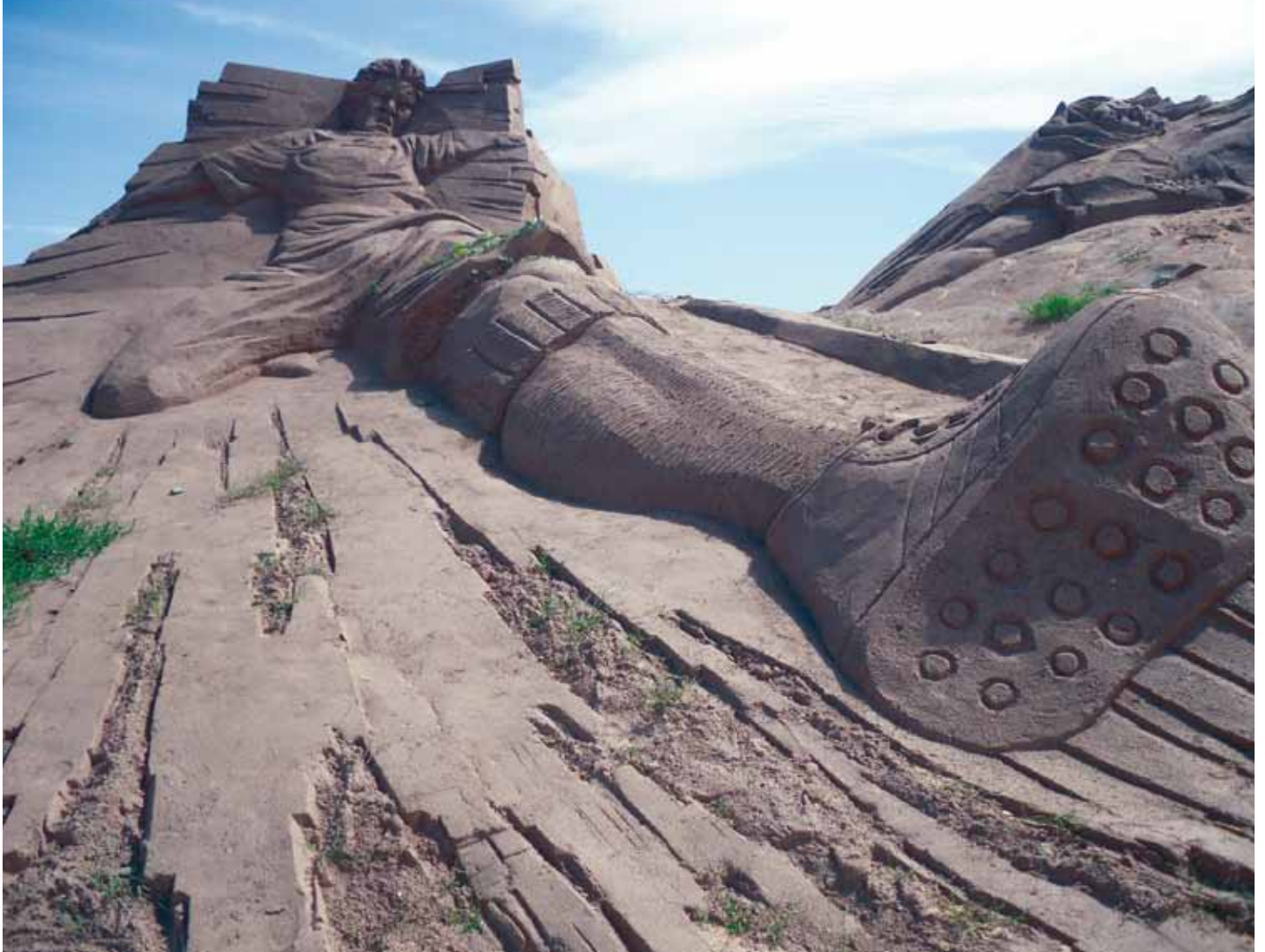
Beach soccer at the sand sculpture park