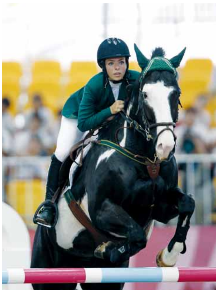
A breakthrough for Saudi Arabian women