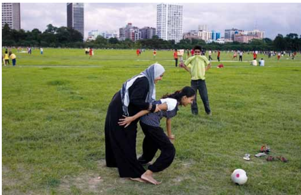
The winning photo from India