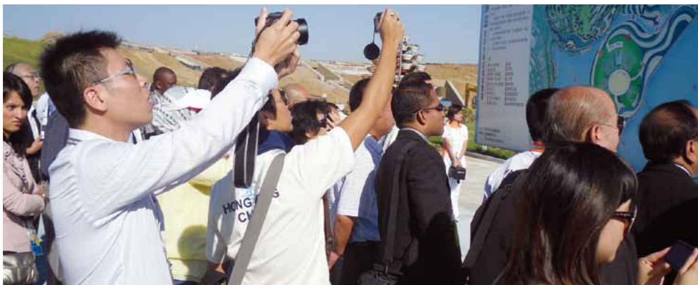
The venue tour calls in at the stadium for the opening and closing ceremony.