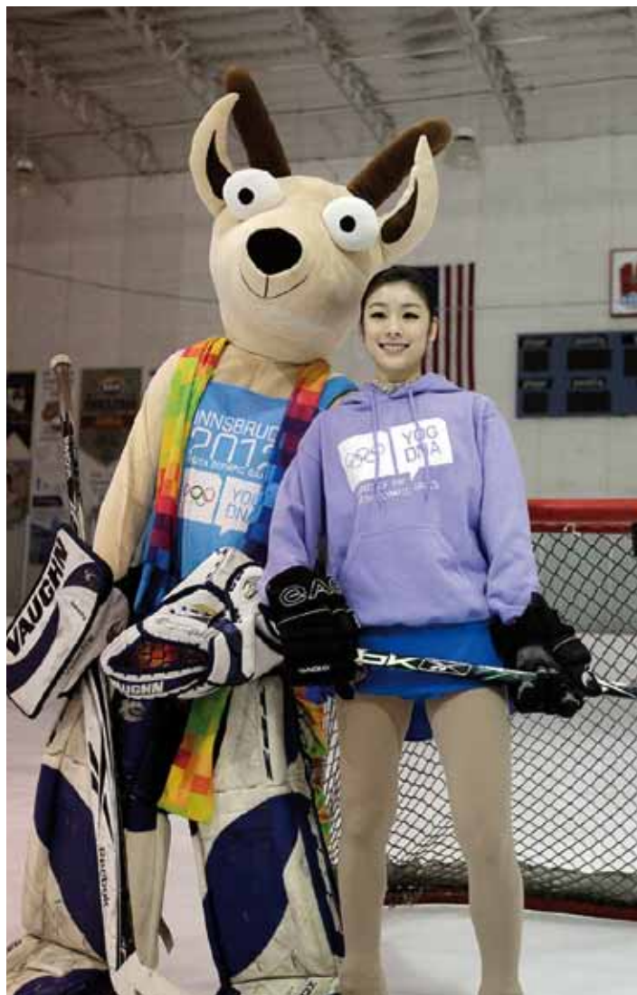
Winter YOG Ambassador Kim Yu Na is pictured with Games mascot Yoggi.

Scheduled to take place from January 13-22, the Innsbruck Winter Youth Olympic Games will attract over 1,000 top athletes between the ages of 15 and 18 from 65 countries. The Games will feature 63 events in seven sports and will also include a Culture and Education Programme.