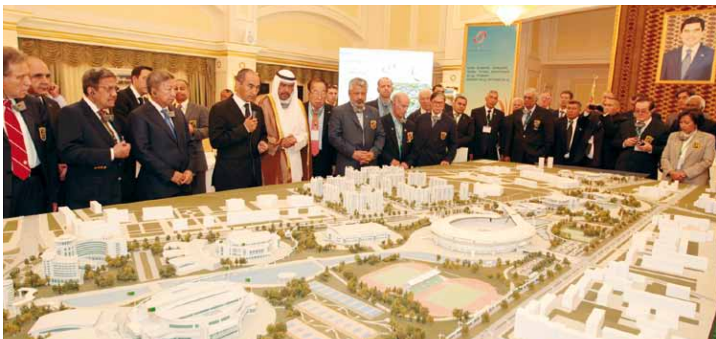
The 60th OCA Executive Board meeting in Ashgabat, Turkmenistan.

The speech drew a standing ovation from the gathering, after which Sheikh Ahmad praised the "wise and strong leadership" in the country.