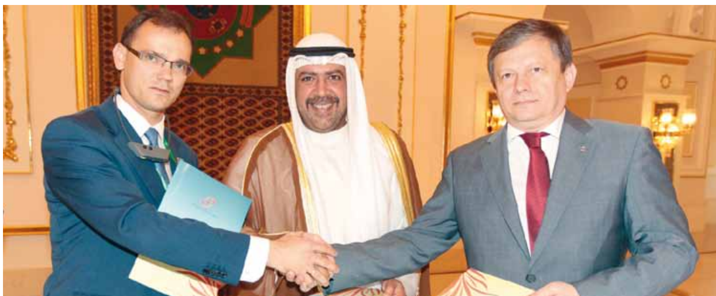
The MoU signing ceremony takes place in Ashgabat.