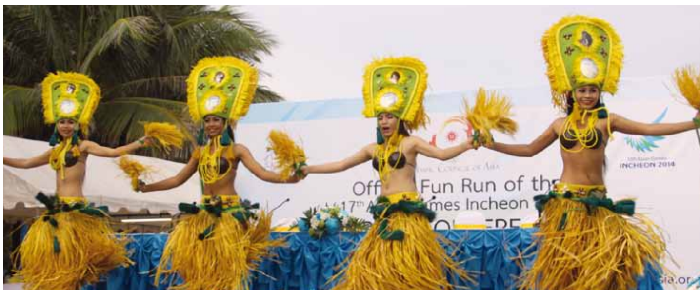
Hawaiian dance in Phuket