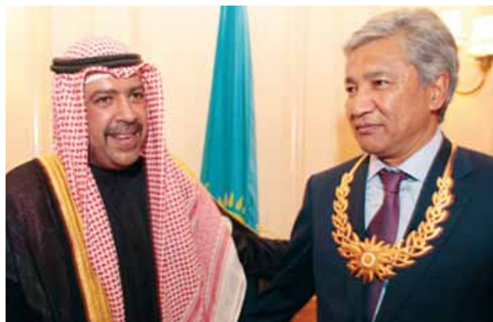
OCA Merit Award to the Mayor of Astana, Imangali Tasmagambetov.