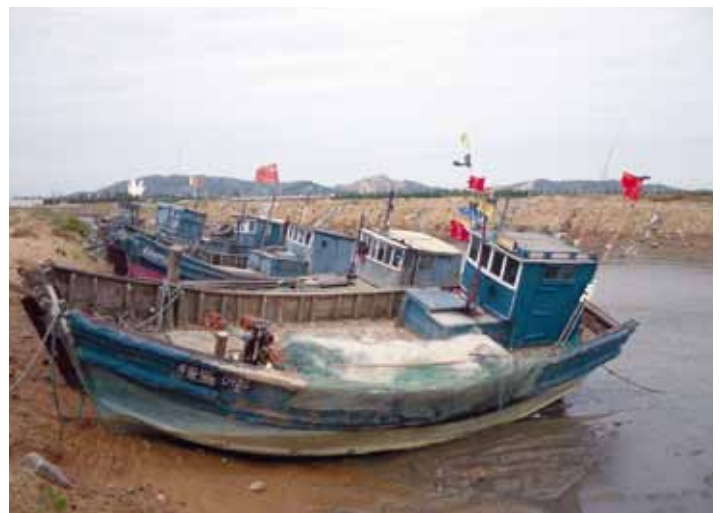
Fishing boats wait for high tide