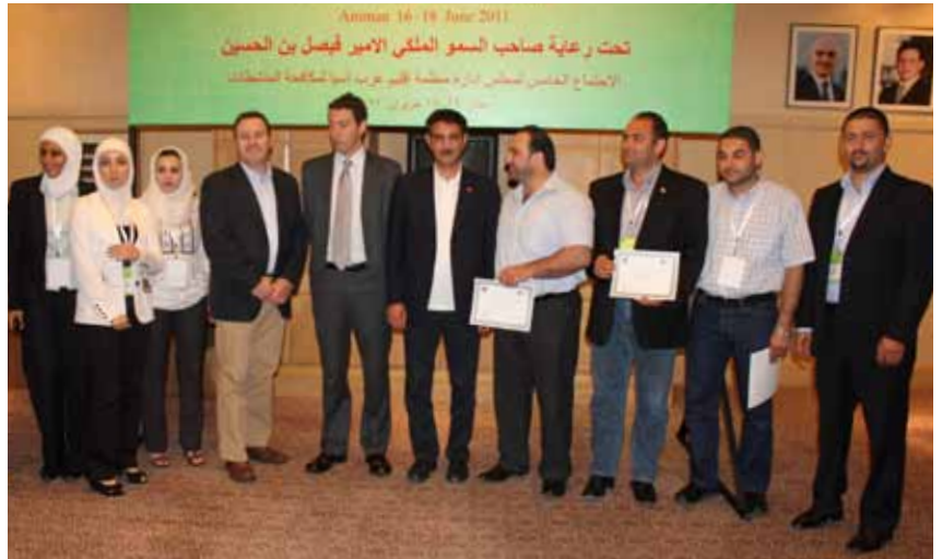
In Amman, Jordan, June 16-18, 2011