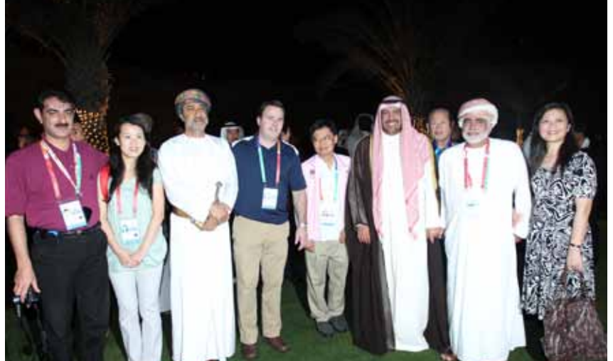
Enjoying the 2nd Asian Beach Games, Muscat 2010.