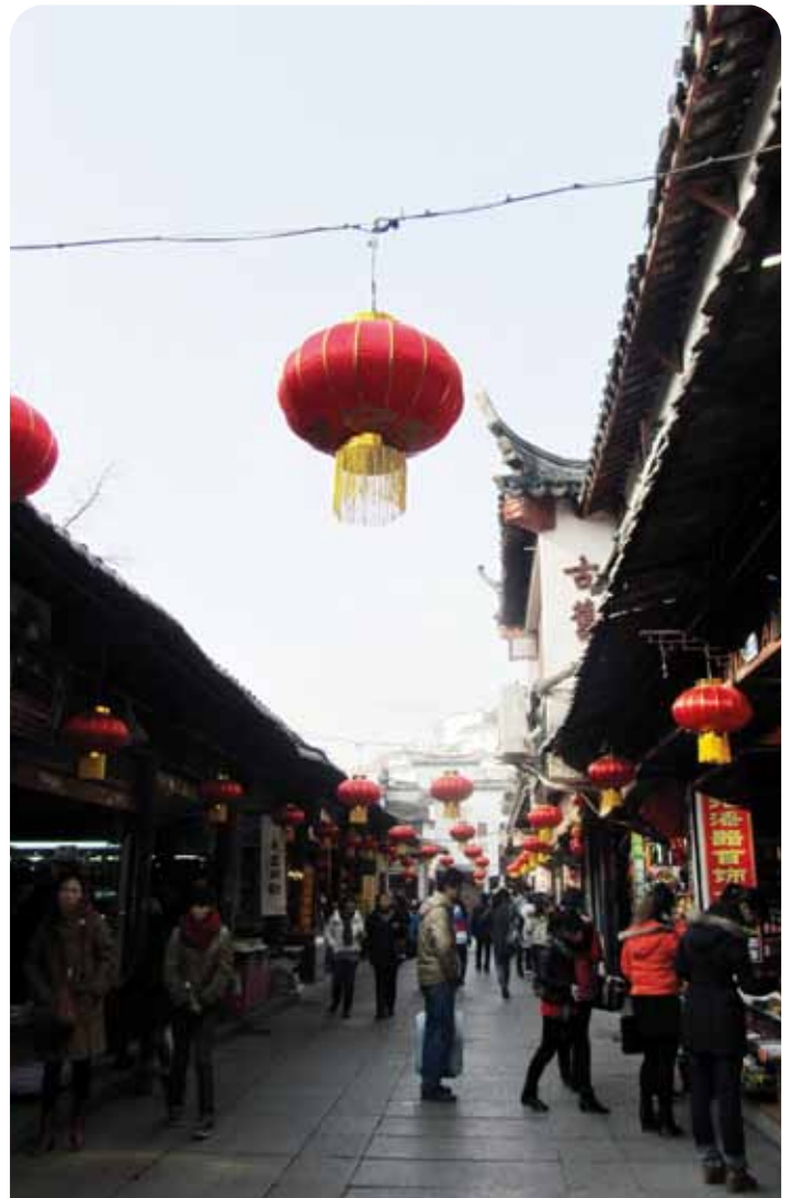
Raise the Red Lantern.