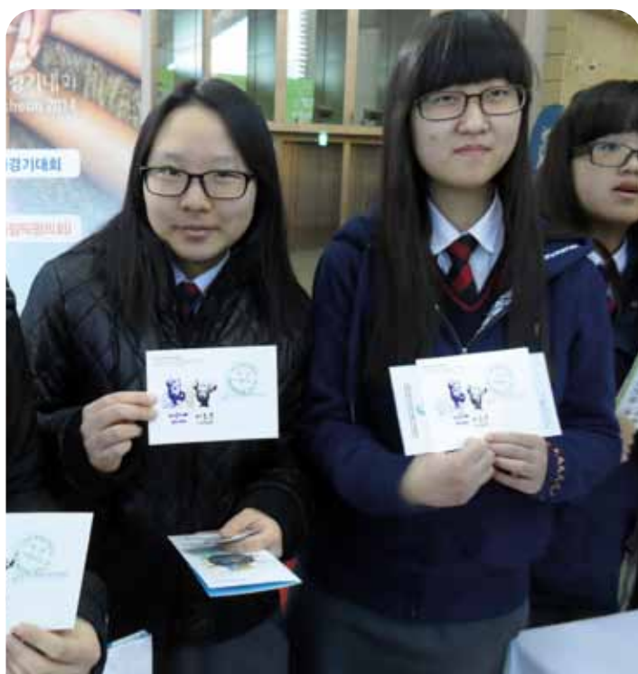
These schoolgirls give their stamp of approval to the Asian Games.