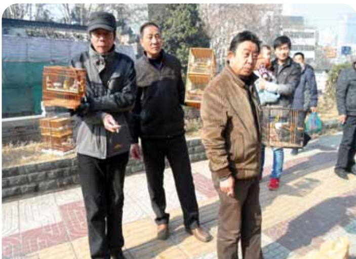
Nanjing residents allow their cage birds to sing in the sunshine.