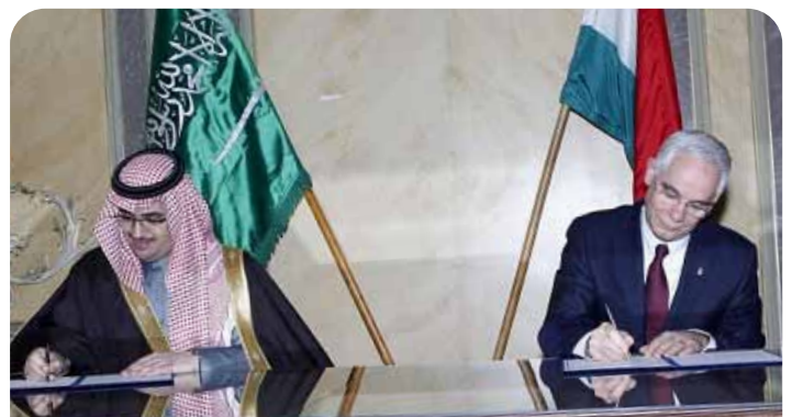
Prince Nawaf signs the joint statement in Budapest.

Prince Nawaf said the statement included an agreement regarding developing direct relations between the sports federations and other sports and youth organisations as well as the National Olympic Committees of the two countries.