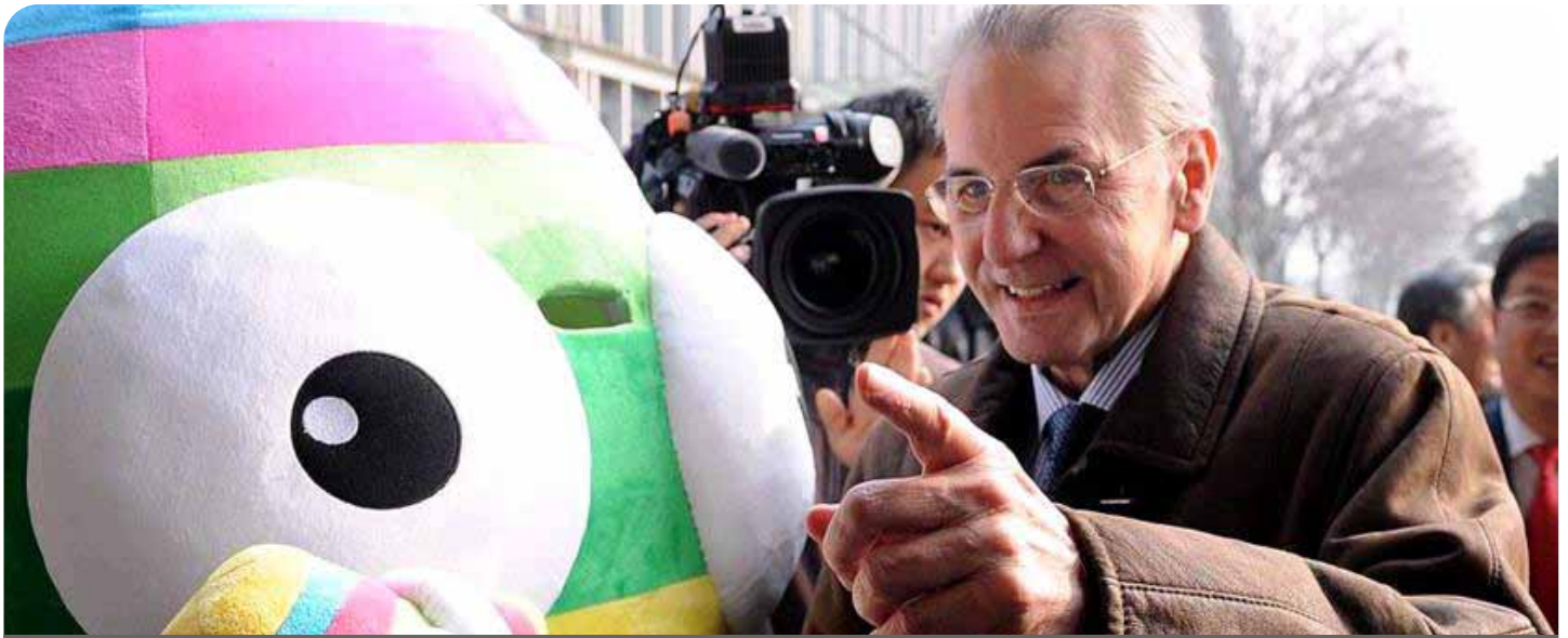
IOC President Jacques Rogge in Nanjing.