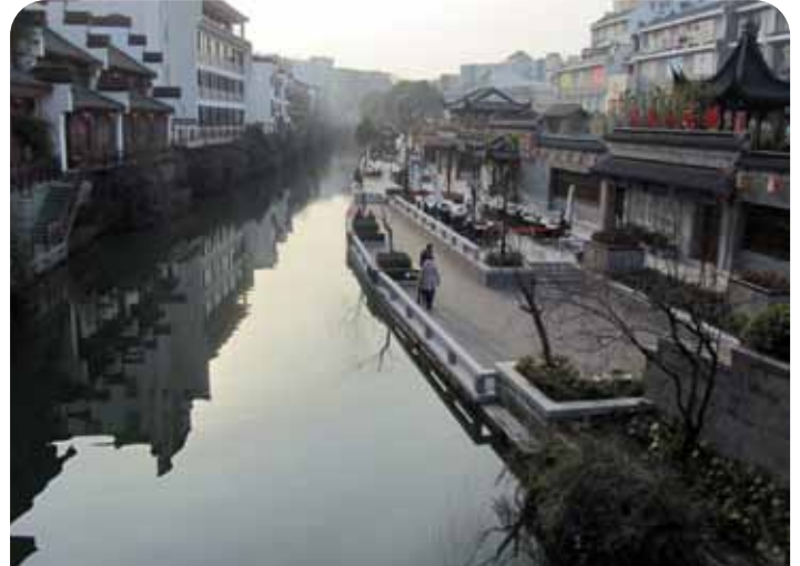
The scenic Qinhuai River.