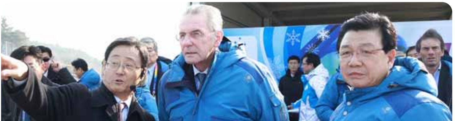
IOC President Jacques Rogge visits PyeongChang.

Speaking at the end of his visit, Rogge said: "Sport in Korea is clearly a national priority. The support from the highest levels of government is clear; the National Olympic Committee is investing heavily in the future of its athletes, and the PyeongChang 2018 Organising Committee is progressing well in its preparations for the Games."