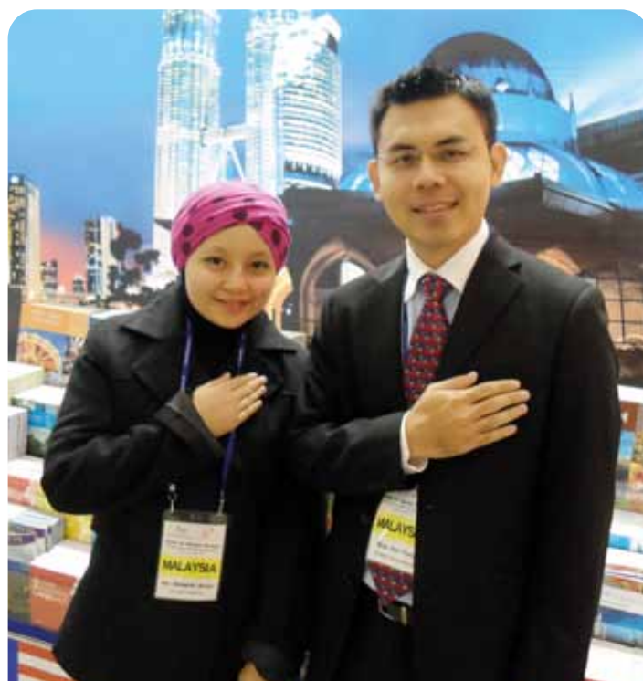
Malaysia NOC delegates feel at home in Korea.