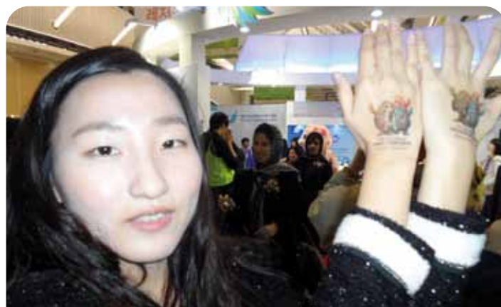
An Asian Games supporter shows off her handy work.

The fair was held at the Songdo Convensia, location for the Main Media Centre at Games time.