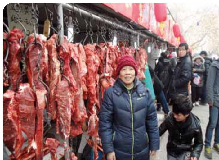
Nice to meat you.