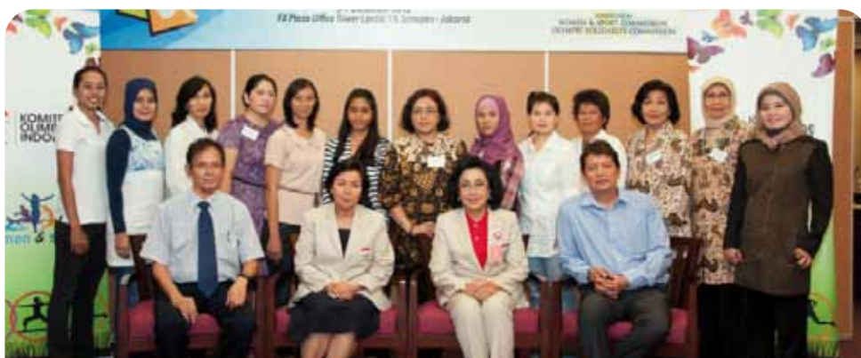
Course participants in Jakarta.