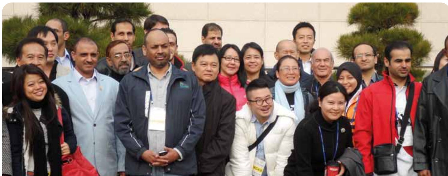
AIMAG Chefs de Mission delegates enjoy their Incheon venue tour.

So while the 4th AIMAG opens a new era for the OCA, it also builds on the legacy of the previous three Asian Indoor Games (Bangkok 2005, Macau 2007 and Hanoi 2009) and the solitary Asian Martial Arts Games (Bangkok 2009).