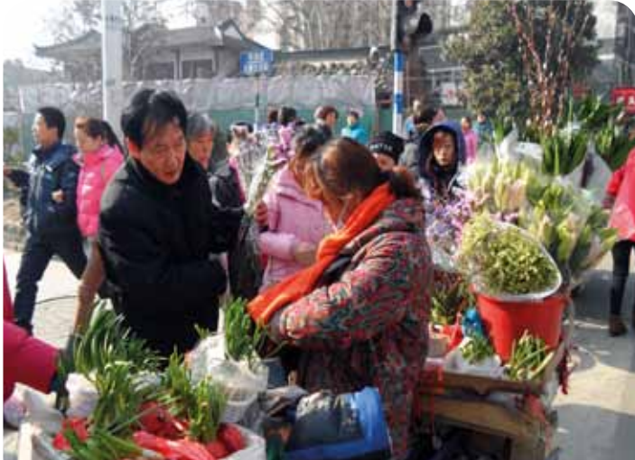
A mobile flower market - on the back of a bicycle.