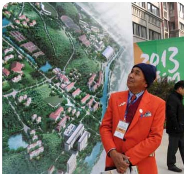
Sita Ram Maskey, Vice President of Nepal NOC, at the Athletes' Village.

"The Asian Youth Games are very important in promoting the Olympic Games as well as the activities of the Asian youth. It is very important for the growth of the Olympic Movement in Asia."