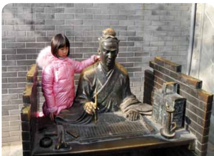
Nanjing - a cradle of learning.