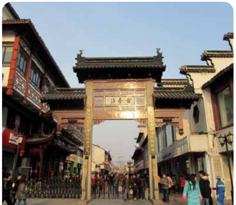
So much to see in Nanjing.

Another aspect of the CEP will be the "Touch Nanjing" project with the emphasis on the environment and eco-friendly agriculture, to be held at the Xing Zhi Learning Base in Nanjing.