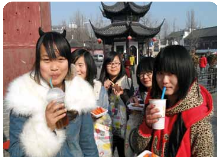
Time for a snack for these youngsters.