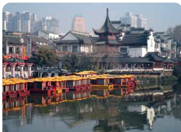
Confucius Temple on the Qinhuai River.