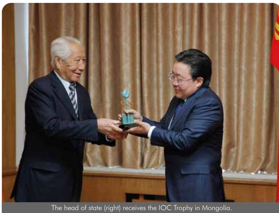
The head of state (right) receives the IOC Trophy in Mongolia.

The theme of the IOC Trophy for 2012 was "Sport and Sustainable Development" and several Asian National Olympic Committees have been busy presenting and promoting the award.