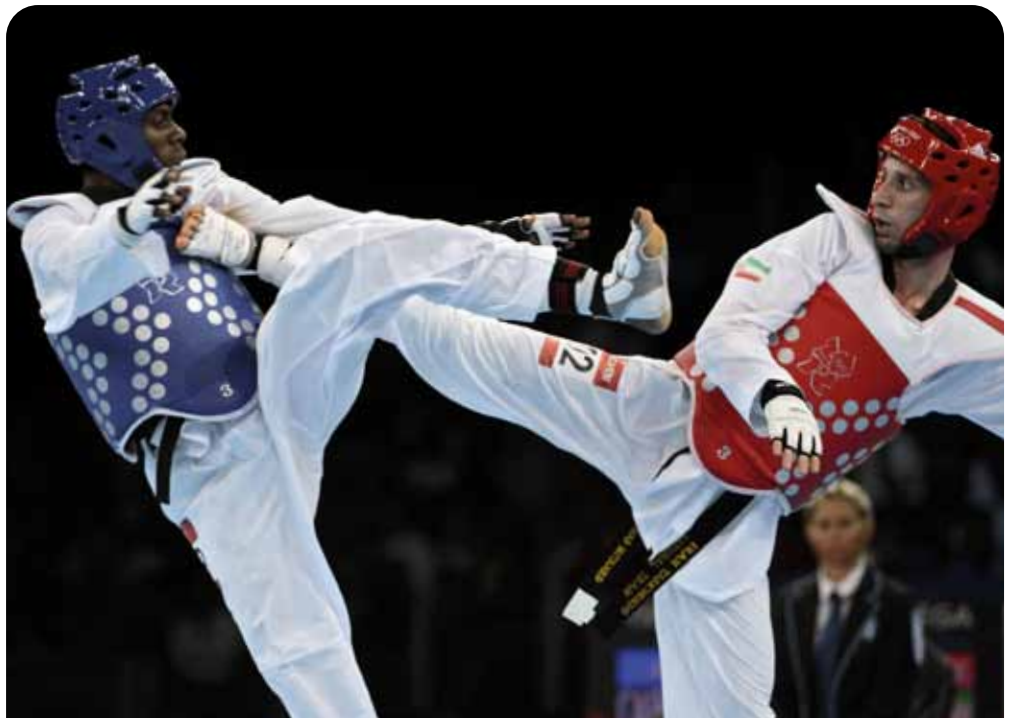
Taekwondo at the London Olympics.

Participants will stay at a nearby hotel, just 15 minutes' walk from the SAT complex, and learn techniques and drills from some of the best in the business in order to prepare for international competition.