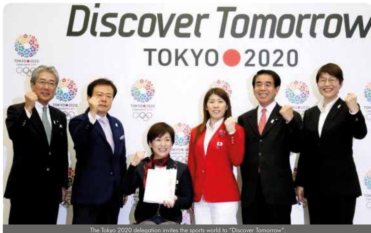
The Tokyo 2020 delegation invites the sports world to "Discover Tomorrow".