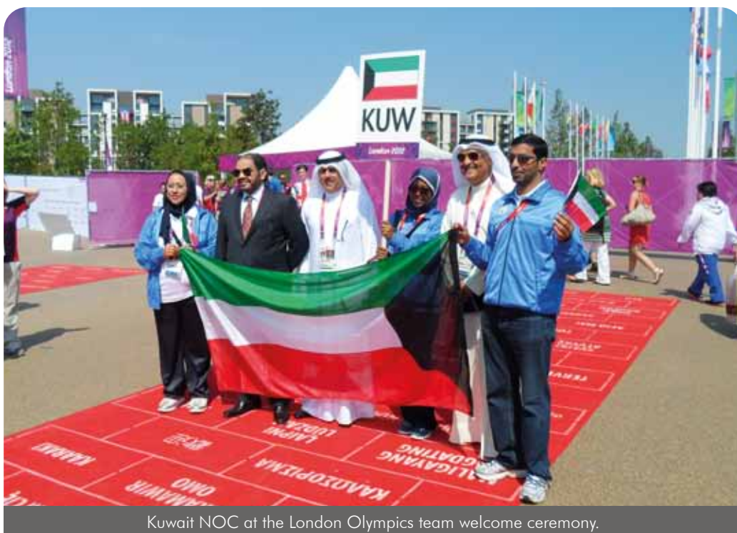
Kuwait NOC at the London Olympics team welcome ceremony.

The IOC confirmed that the Kuwait NOC and national sports federations are now able to operate in full compliance with the Olympic Charter and the rules of the International Federations.