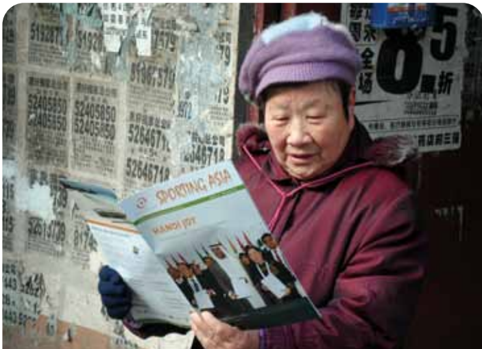
A Nanjing resident reads all about the OCA.