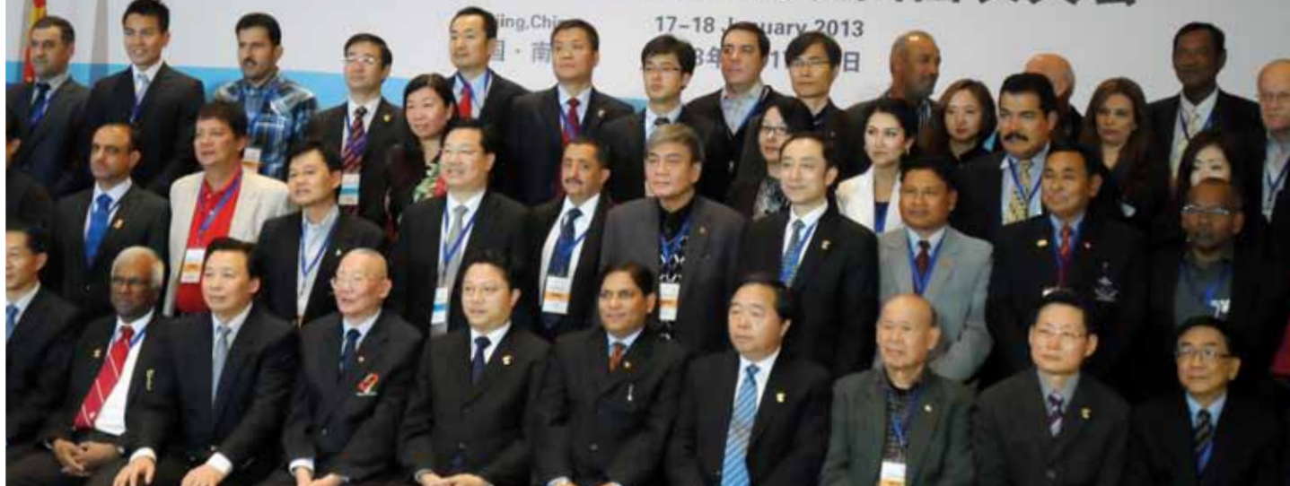
The Opening Ceremony of the CDM Seminar in Nanjing.