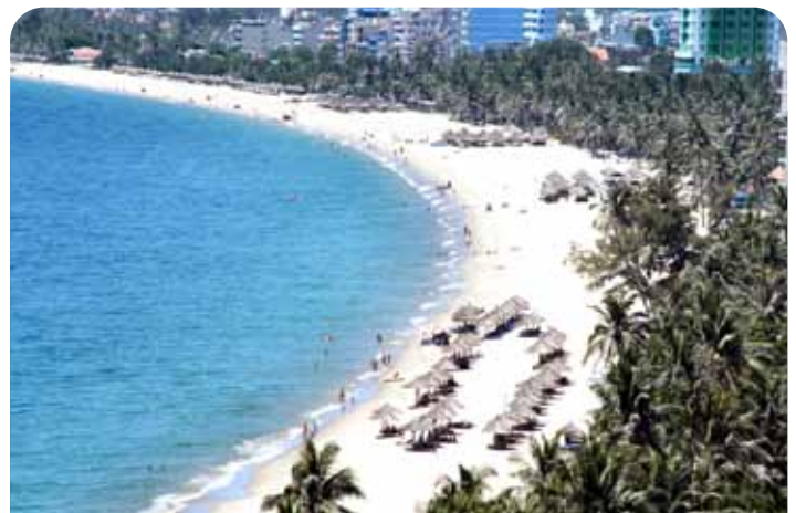
Vietnam's glorious beaches await the OCA.

The sports programme is not finalised but the 18 on the provisional list are: beach sepaktakraw, beach volleyball, beach soccer, beach woodball, jetski, beach wrestling, marathon swimming (5-10km), 3x3 basketball, beach kabaddi, beach pencak-silat, beach handball, windsurfing, sailing, beach shuttlecock, beach vovinam, dragon boat, water polo and body building.