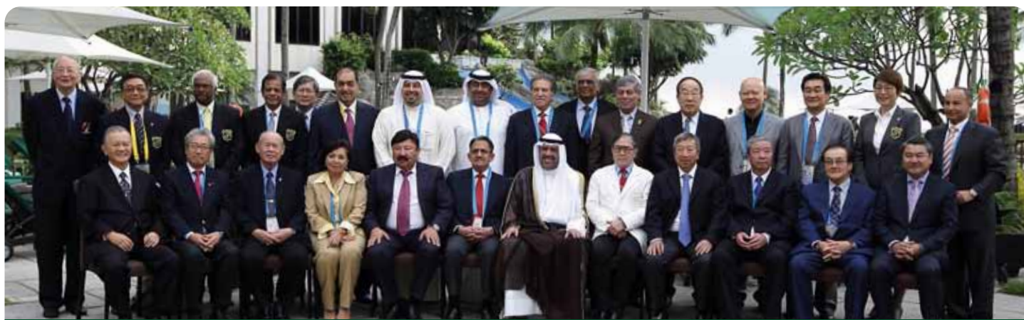
The OCA Executive Board gathers in the tropical gardens of the Sofitel Hotel for a photo shoot.

The 64th OCA Executive Board meeting was held at the Sofitel Hotel in Manila on Friday, January 17, setting the scene for the 32nd OCA General Assembly the following day.