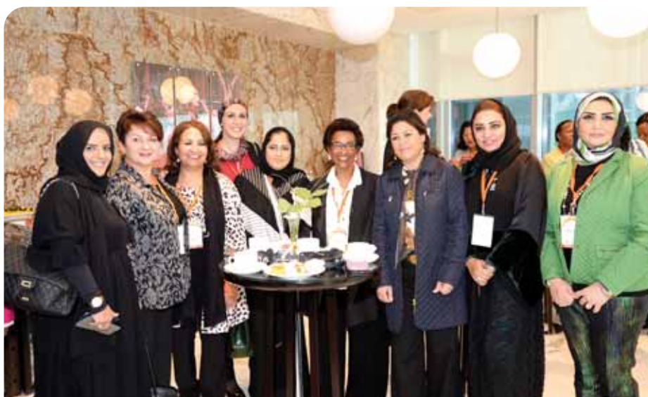
Photo call for women and sport leaders.