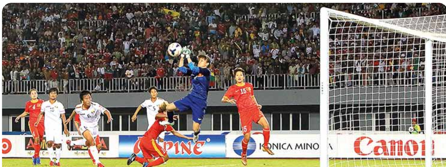
The football tournament of the 27th SEA Games attracted large crowds.

Singapore will host the 28th SEA Games from June 5-16, 2015.