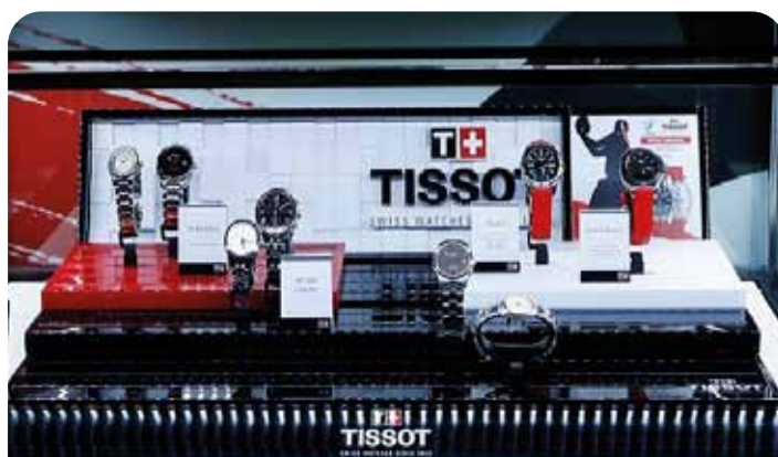
Swiss watchmaker Tissot, the official timekeeper of the 2014 Asian Games, and the 2014 Incheon Asian Games Organizing Committee held a launching ceremony for the company's 2014 Asian Games Special Collection at the Park Hyatt Seoul on February 10. The collection comprises of eight watches, and sales will begin in March.