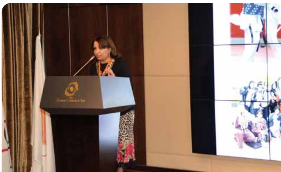
Shaikha Hayat of Bahrain addresses the forum.