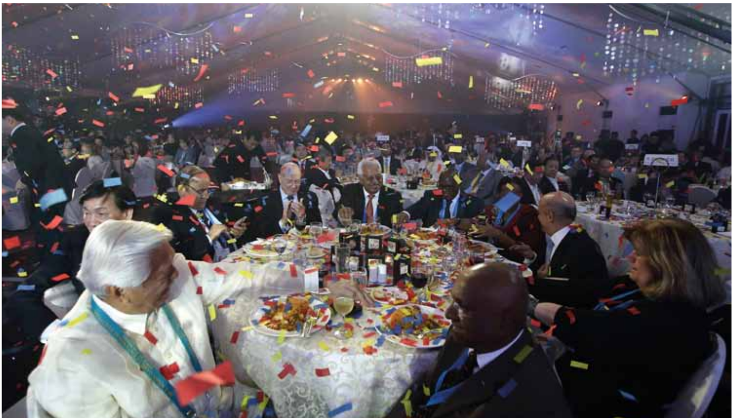
The Centennial Festival is in full swing for the VIP guests.