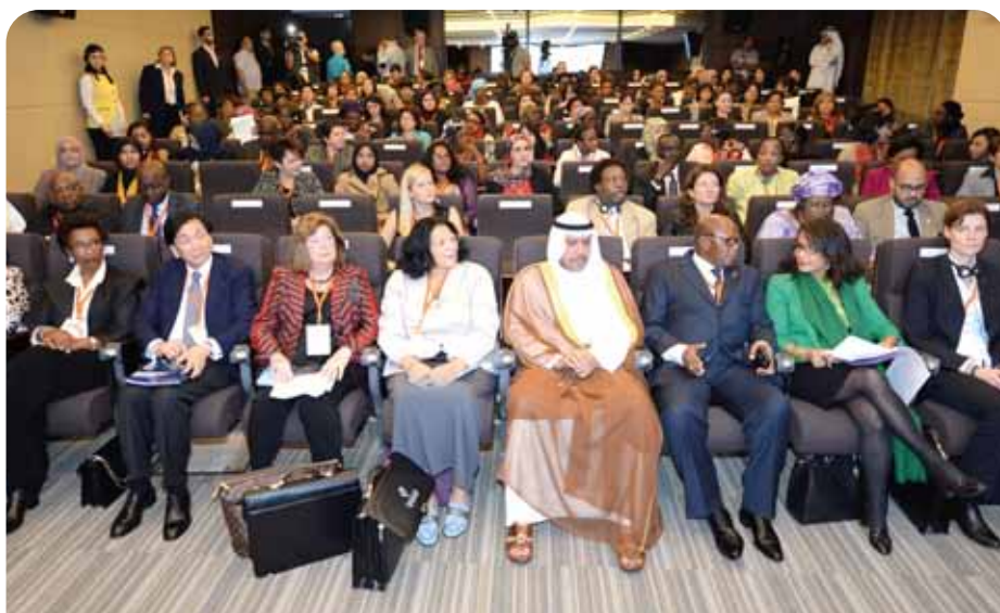
Delegates attend one of the presentations.

The forum, which will be held every two years, produced the Kuwait Action Plan, an 11-point resolution aimed at increasing the level of female participation in all aspects of sports administration and management.