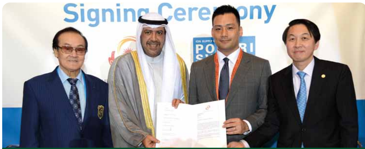
The signing ceremony with Otsuka.

Otsuka Pharmaceutical Co Ltd of Japan signed a sponsorship agreement with the OCA during the General Assembly to make Pocari Sweat the official sports drink for athletes and other participants at the next two Asian Games: Incheon 2014 and Hanoi 2019.