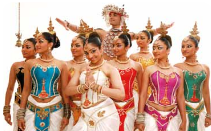
Culture and colour in Hambantota.

Although the sports programme has not been decided, Hambantota officials are keen to cater to popular local demand by including rugby sevens and 20-20 cricket.