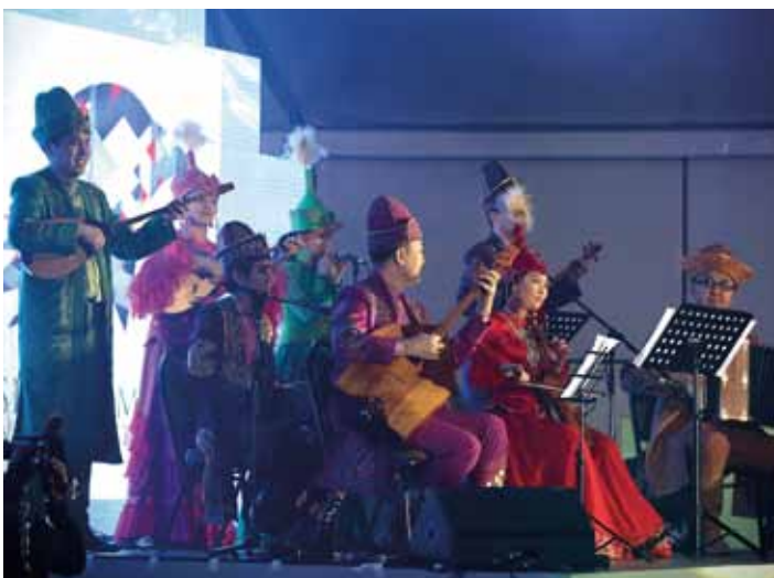
A musical performance captivates the audience.