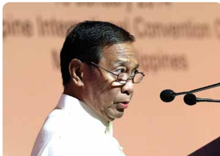
Vice President Binay delivers his address.

"We were ready in Boracay to give you a good show, but unfortunately it was not supposed to be there. We had to think it over, but we received a lot of encouragement to continue to host this affair – and we did."