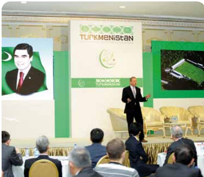
The International Sports Media Forum in Ashgabat.

"The developments in Turkmenistan will add value to the country, the region and to the Olympic movement in Asia and the world."