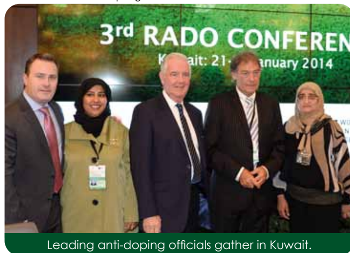
Leading anti-doping officials gather in Kuwait.

A need to seek additional funding from partners to enhance the RADO programme