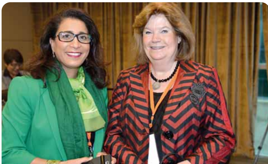
IOC members Nawal El Moutawakel and Gunilla Lindberg.