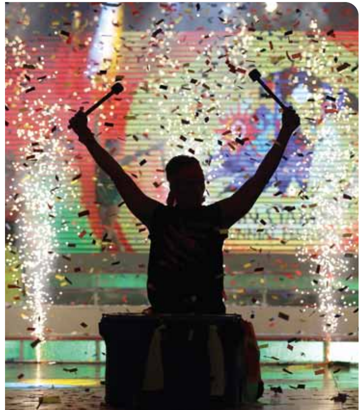
Tickertape and drums create a party atmosphere.