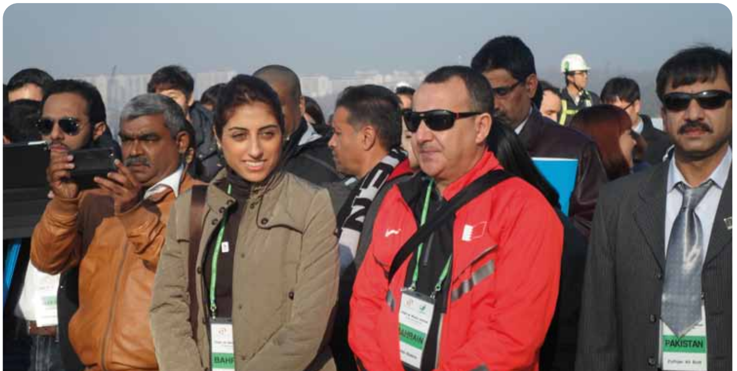
Checking out the Asiad Main Stadium.