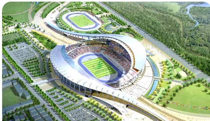
All eyes will be on the Asiad Main Stadium at the Incheon Asian Games.