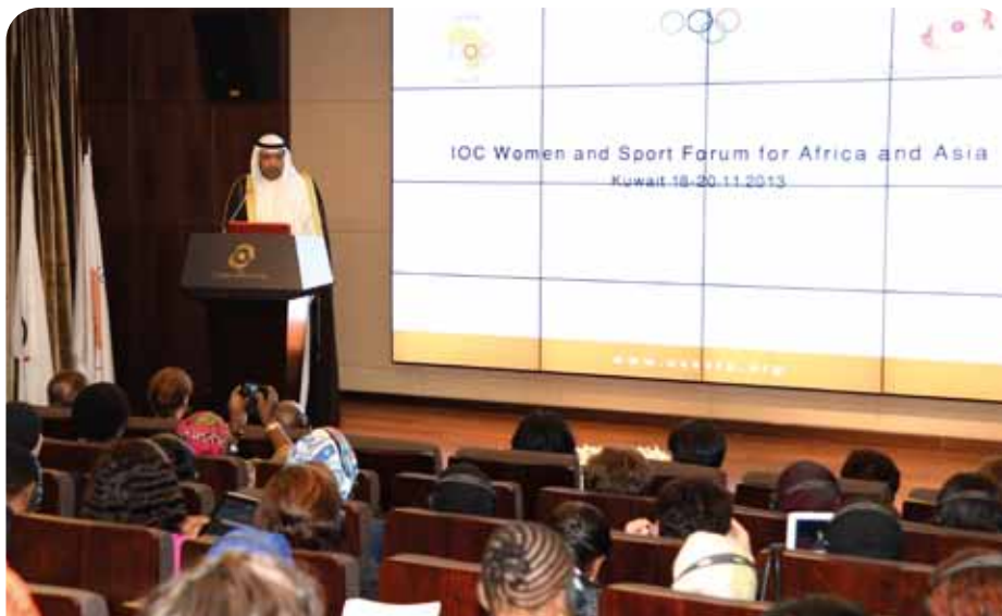
The OCA President welcomes delegates to Kuwait.