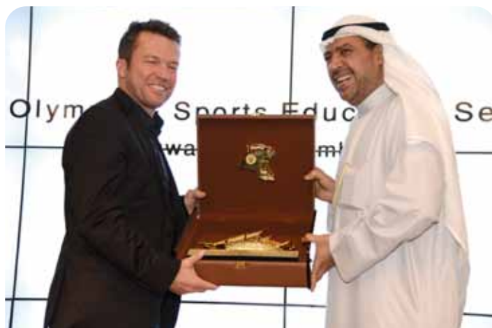
Lothar Matthaus with the OCA President.

Bubka, the 1988 Seoul Olympics pole vault champion from the Ukraine and now an IOC Executive Board member, urged women and girls in Asia and Africa to take up sport in order to build a strong character, lead a healthy lifestyle and achieve their goals.