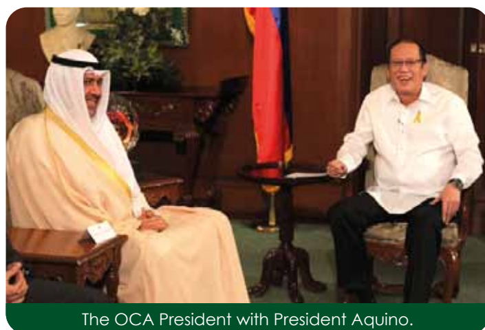
The OCA President with President Aquino.

✱ to give a signal to the sports world and tourism industry that the Philippines is secure to host events and welcome visitors