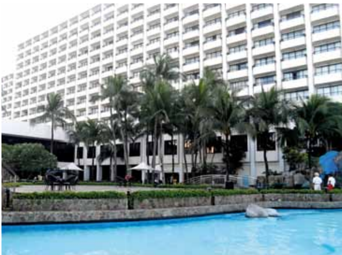
The Sofitel - HQ hotel for the OCA GA and Centennial Festival.