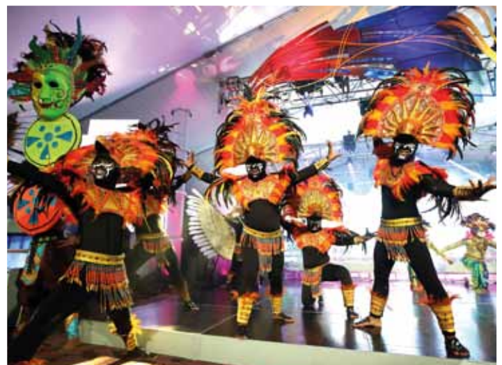
On the war path...scary stuff!