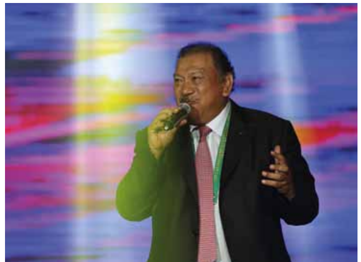
HRH Prince Tunku Imran leads the karaoke session.