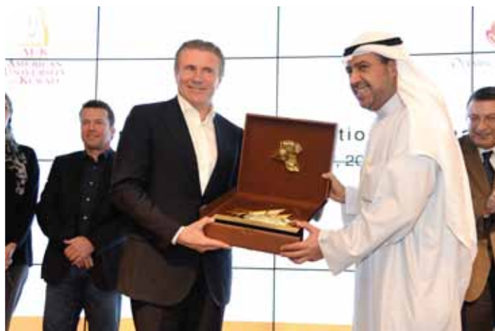
Sergey Bubka receives a gift from the OCA President.