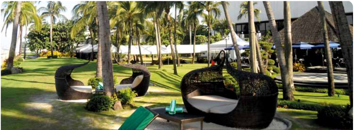
The tropical gardens of the Sofitel Hotel in Manila Bay.