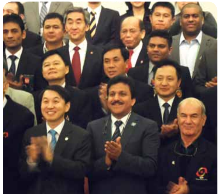
A job well done at the CDM Seminar.

The venue tour included the new, US$465 million Asiad Main Stadium, Athletes' Village, Park Tae Hwan Munhak Aquatics Centre, Incheon 2002 World Cup football stadium, hockey stadium and boxing gymnasium at Seonhak.