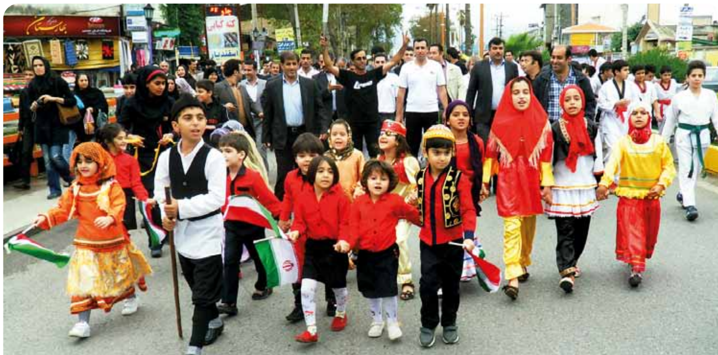
The Sport for All Festival reaches all generations in a mass of colour and celebration.

T he NOC of the Islamic Republic of Iran held the 6th Sport for All Festival over two days in Mazandaran province with the aim of promoting peace and solidarity.